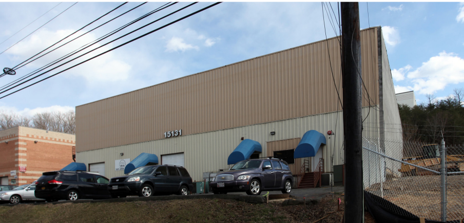
15131 Southlawn Lane -unit F Catering Kitchen - Approx: 3600 SF